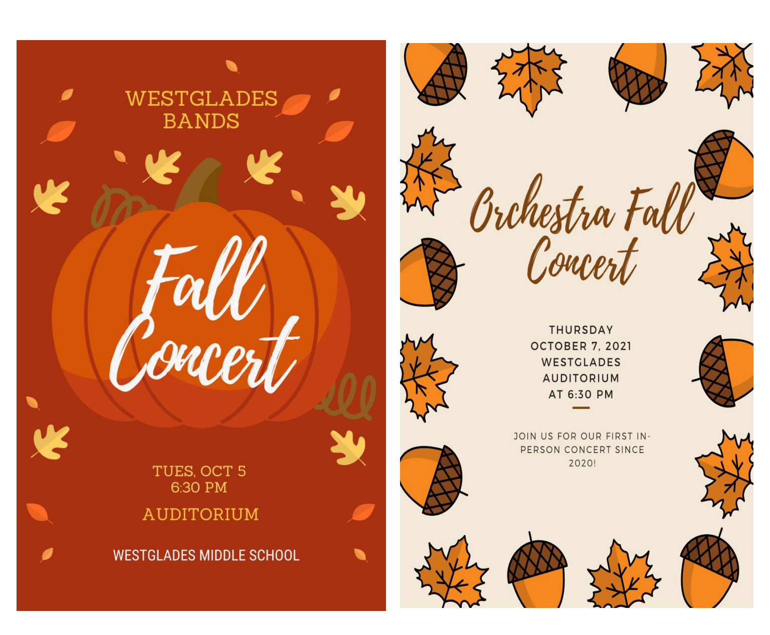
Tues. 10/5 and Thurs. 10/7, 6:30pm